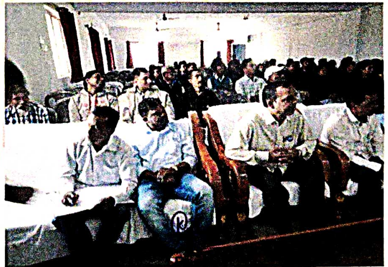
Rambha College of Education Gitilata, JSR-832107

☎ 9102999123, 9102999124 ✉ contact.rambha@gmail.com 🌐 rambhacollege.in